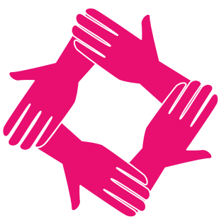
Reaching the Community